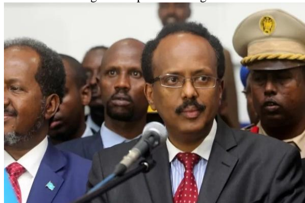
Fig. 3: People of Somalia