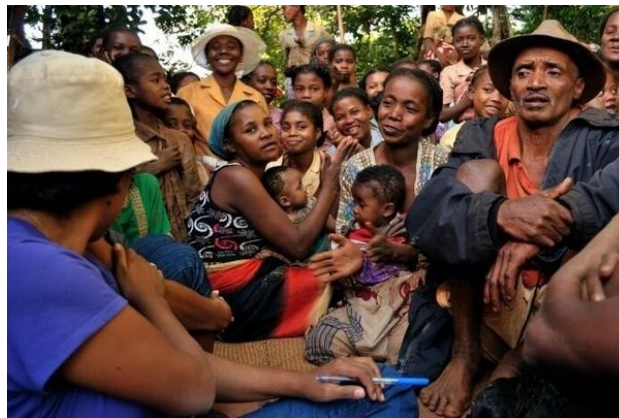
Fig. 2: People of Madagascar